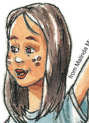
Illustration © John Lund