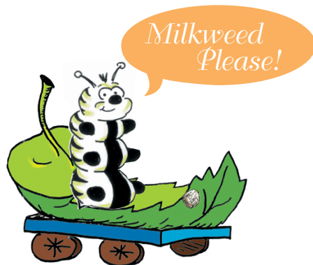
Caterpillar illustration © Chris Putland